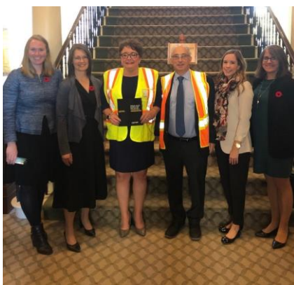
Atlantic Preventable event held at the NS Legislature in October 2019 featuring Atlantic Preventable partner representatives, ACIP Executive Director, and members of the NS Legislature.

A media release was sent on September 16, 2019. Earned media opportunities included 2 radio interviews (1 in NL and 1 in NS) and 1 TV morning show (in NS). An event was held with NS partners at the NS legislature on October 29, 2019. This event aimed to bring recognition to campaign efforts.