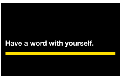
Campaign messaging focused on the tagline "Have a Word with Yourself."

Phase I of the campaign consisted of TV ads (English and French), a website page, and social media engagement.