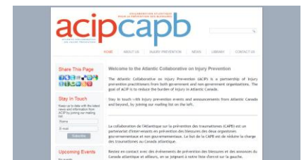
ACIP Website Homepage

ACIP continues to operate a website and listserv as a hub of injury prevention resources, events, and news items.